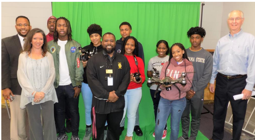
Vienna Video Production Crew